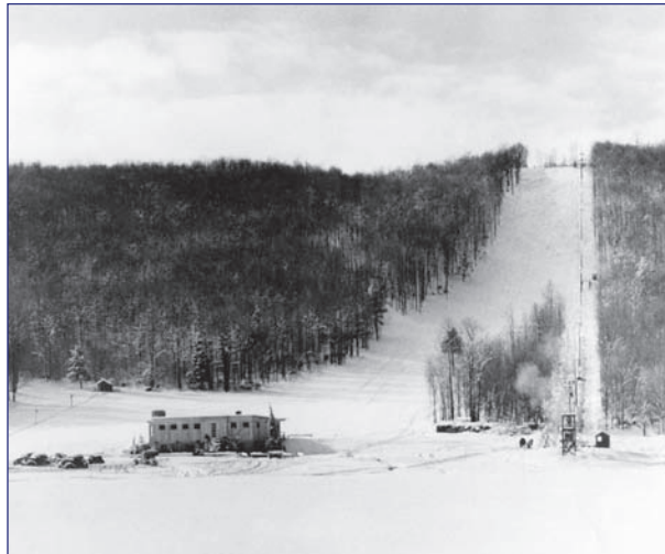
Boyne Ski Club, 1948/49.