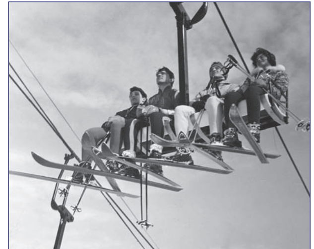
The first four-person chairlift in the world, 1964.