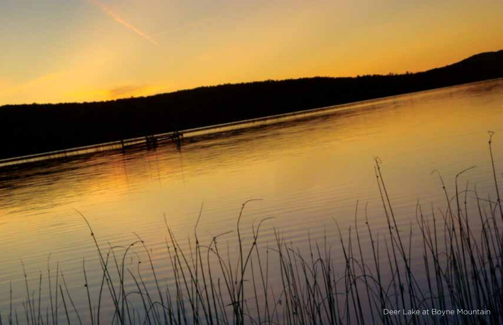
Deer Lake at Boyne Mountain